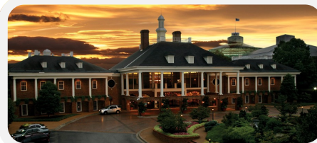
The Gaylord Opryland - Site of the General Conference

The price includes round-trip transportation on a luxury 55-passenger coach, three nights at the Hyatt Place Hotel, refreshments on the bus and a full hot breakfast each morning.