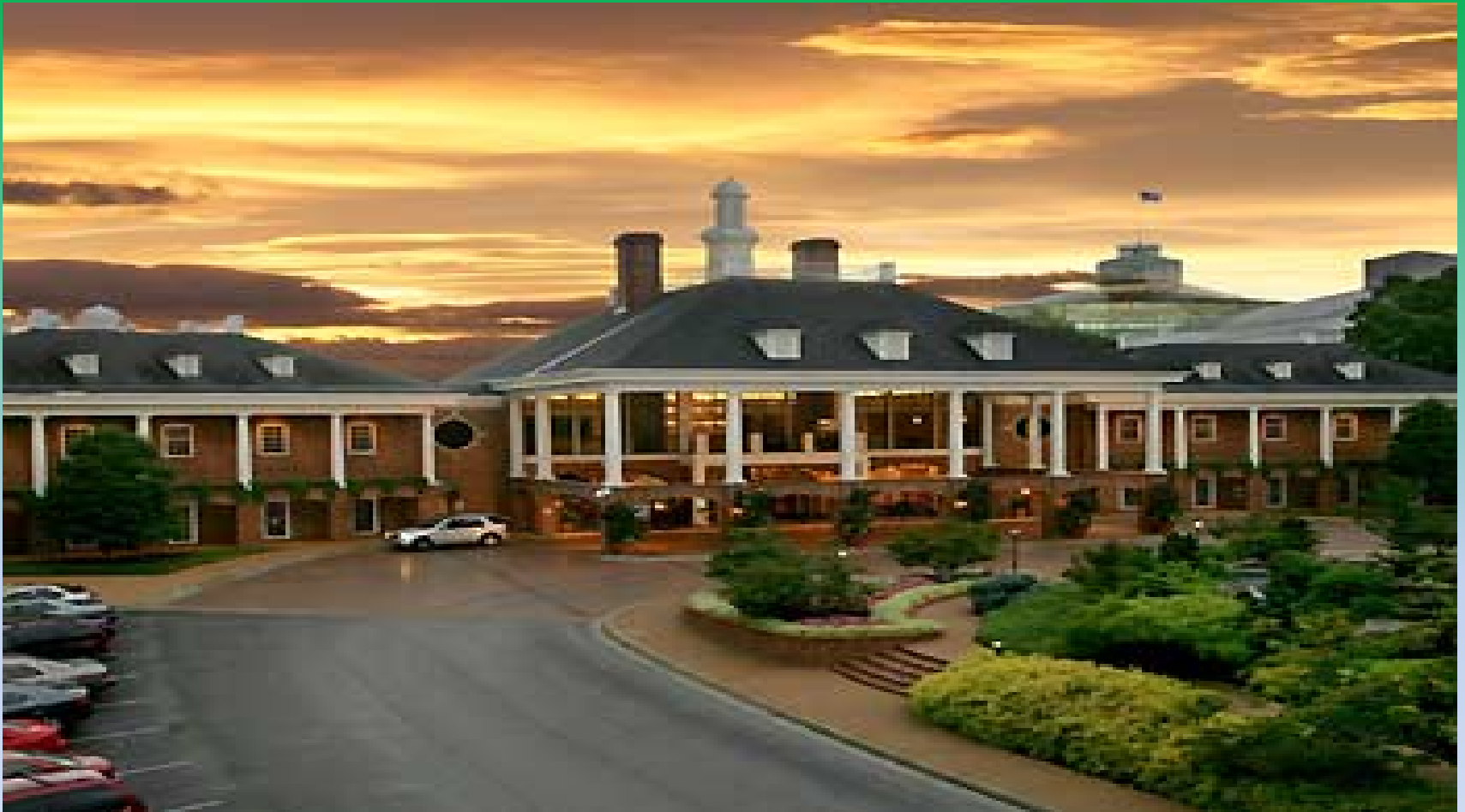
Gaylord Opryland Resort and Convention Center Nashville, TN