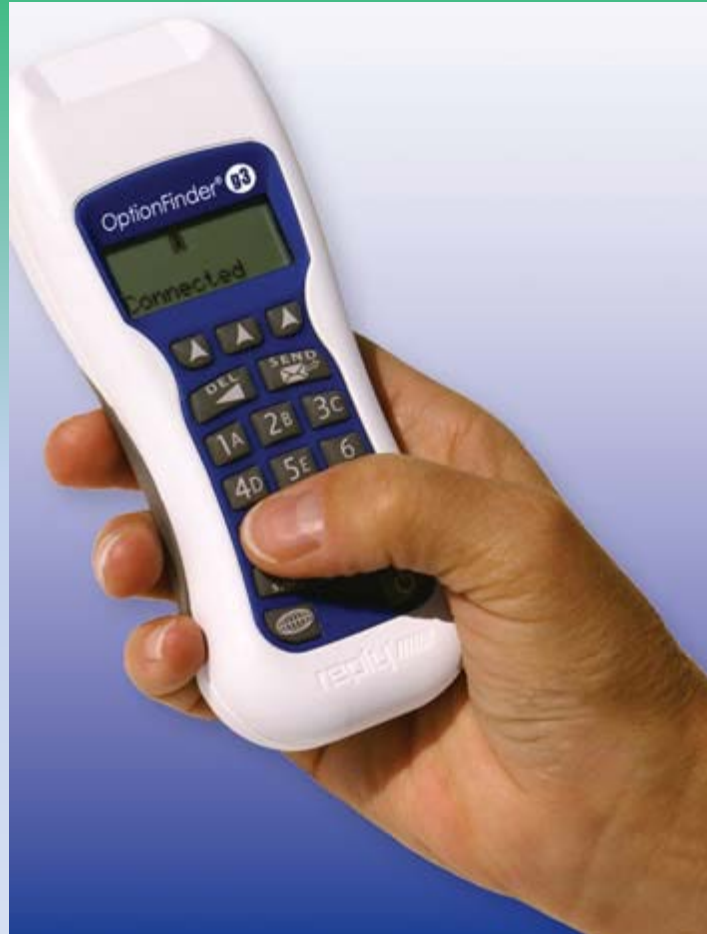
Hand Held Device